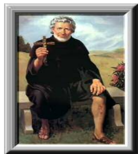
Saint Peregrine Patron Saint of Cancer Patients:

God, who gave Saint Peregrine an angel as his companion, the Mother of God as his teacher, and Jesus as the physician for his illness; grant, we ask You, that we on earth may intensely love the Blessed Virgin Mary and our Saviour, and in Heaven bless them forever. Grant that we receive the favor for which we now ask ..... through Jesus Christ Our Lord. AMEN.